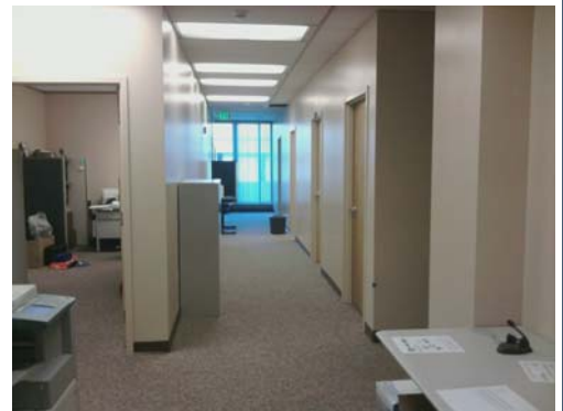
Patrol Lieutenants' offices

LEIS is working hard on the installation of the encrypted wireless air card system. To date there are approximately 40-air cards installed in various applications. The roll out should be complete by the end of this year so all patrol vehicles will have broadband wireless service throughout the region. The COPS shops router installations should also be wrapping up by the end of the year so officers will also have wireless access while in these facilities. This will greatly enhance usability of our computer systems, such LEWeb, CAD, email, etc.